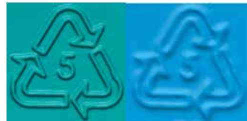
Comparison of scans with different mesh densities

The small scanning area in combination with the high-resolution cameras allows for an unsurpassed point-to-point resolution of 28 \mu\text{m} (point density higher than 1200 points/mm 2 ).